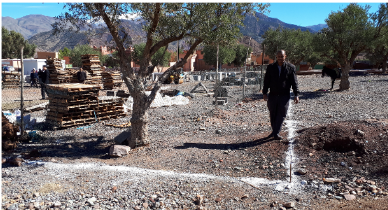
Chalking the area where house 6 will be built

We had already found out that there was a new Lycée being opened near one of our houses in Talat N'Ya-coub, and so the process began of securing some land and receiving planning permission, and building has now commenced. We plan to open the doors to house number 6 in time for the new school year in September 2019.