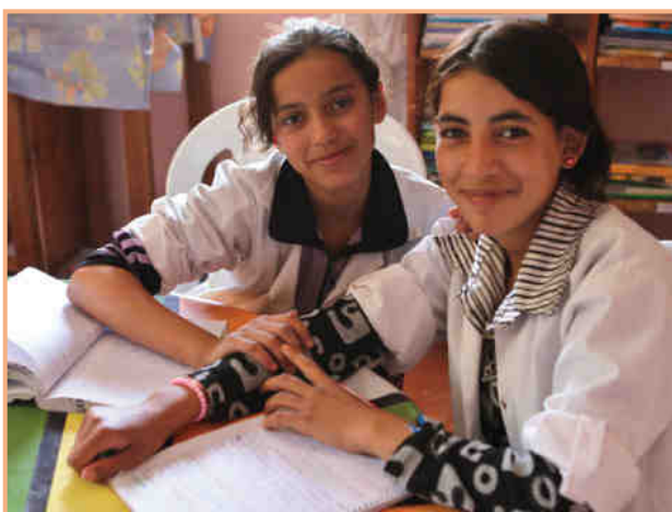
School results for 2013/2014